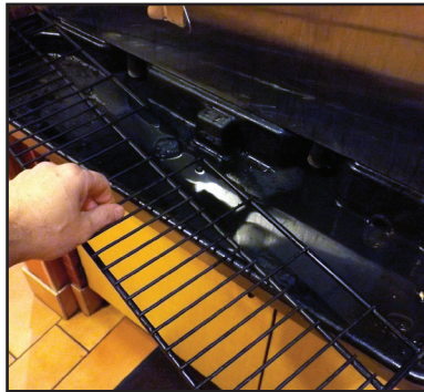
Remove beverage tray top