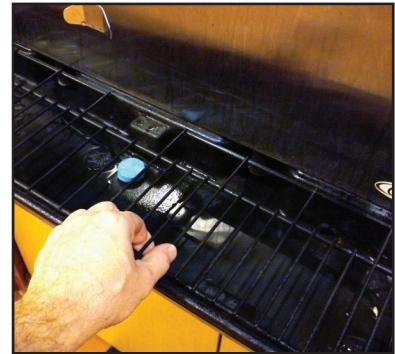
Replace beverage tray top. Ready to go!